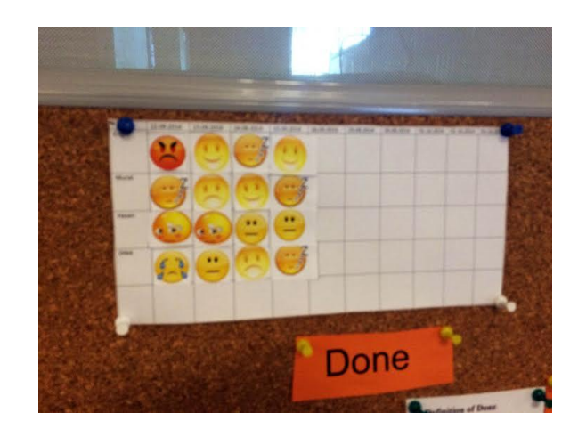
View from the board of a team working on how to enhance the efficiency by observing the daily modes of the team members.

Teams better manage daily work and take responsibility as they see the work to be done on the Sprint Backlog and the remaining work on the Burndown Chart. Thus, there is no need for the Product Owner or any other person to put pressure on the team members to get the work done.