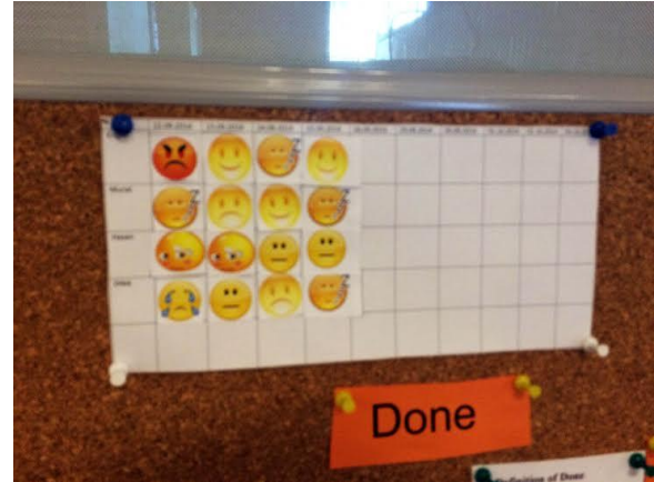
View from the board of a team working on how to enhance the efficiency by observing the daily modes of the team members.

Teams better manage daily work and take responsibility as they see the work to be done on the Sprint Backlog and the remaining work on the Burndown Chart. Thus, there is no need for the Product Owner or any other person to put pressure on the team members to get the work done.